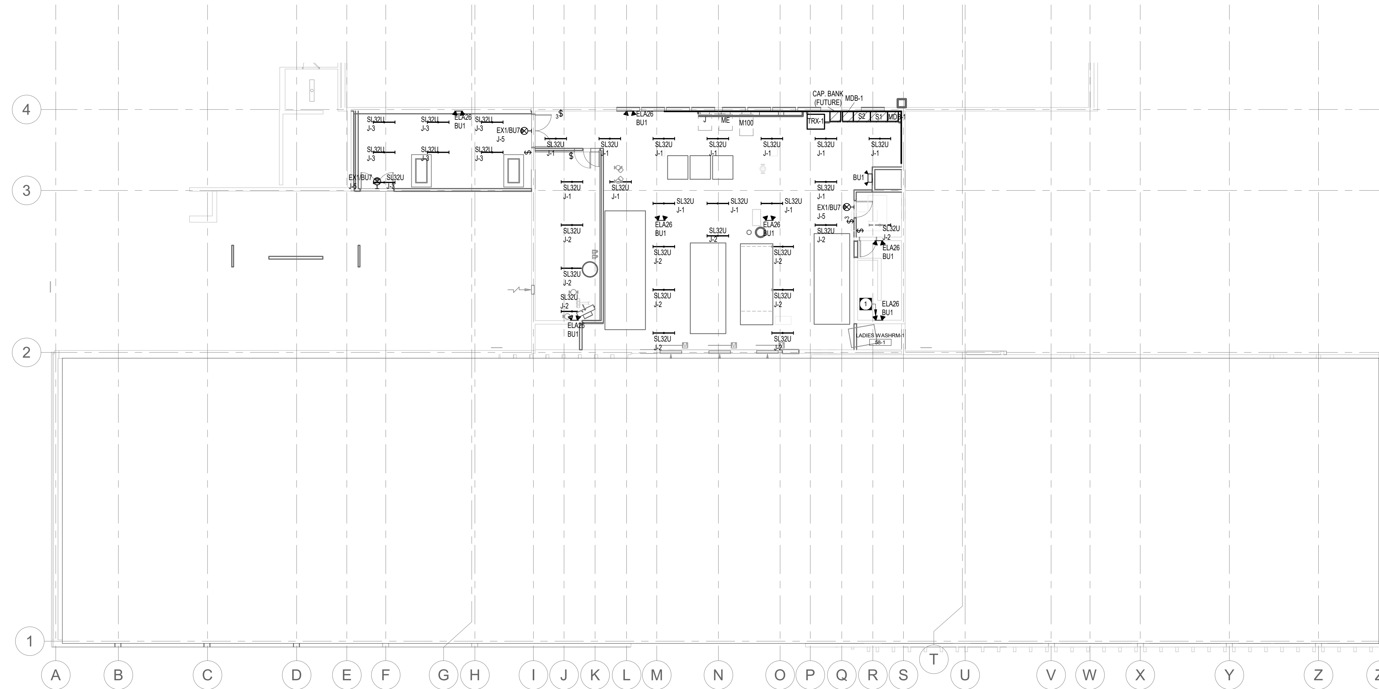
LEVEL 2 - LIGHTING RENOVATION 1/EL2.2 3/32" = 1'-0"